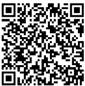
Table of contents below

Available at http://nuspress.nus.edu.sg/ Please enter "MSS10" to enjoy a 10% discount.